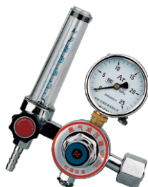
氮气减压器 Argon reducer