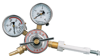
乙炔减压器 Acetylene reducer