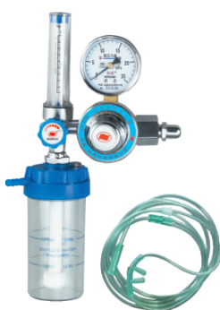
YX-90A浮标式氧气吸入器 YX-90A Float-type Oxygen Inhaler

The product can also be applied in environment pollution, special working, scientific research unit and emergent usage of small-scale welding and cutting.