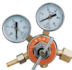
氮气减压器 Nitrogen reducer