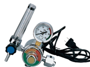
二氧化碳减压器(电热式) Carbon dioxide reducer(electric heating)