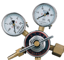
氧气减压器 Oxygen reducer

All kinds of pressure reducer can adjust the high pressure in the container or tube to the pressure which is needed, and can make this pressure unchangeable. It is widely used in machine industry, shipping, metallurgical industry, chemical industry where the welding, cutting, auto-cotrolling is needed.